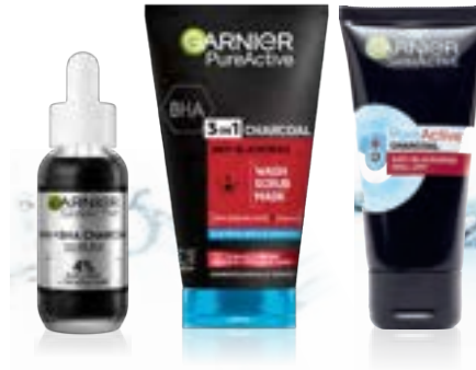
FOR STUBBORN BLACKHEADS & IMPERFECTIONS