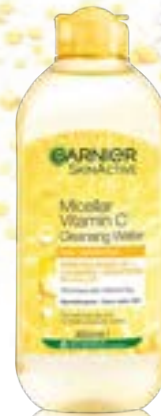
TO BRIGHTEN DULL SKIN