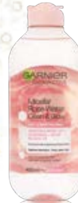
TO BOOST SKIN'S GLOW