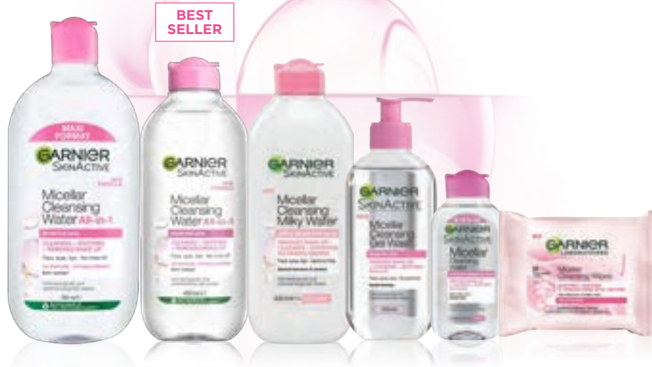
SENSITIVE TO NORMAL SKIN