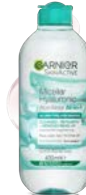
TO REPLUMP DEHYDRATED SKIN