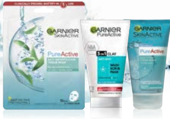
OILY TO COMBINATION SKIN WITH IMPERFECTIONS