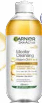
FOR LONGWEAR MAKEUP USERS