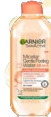
TO GENTLY EXFOLIATE SKIN