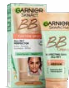
EVEN TONE SPF50